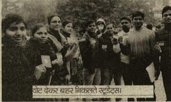
वोट देकर बाहर निकलते स्टूडेंट्स।